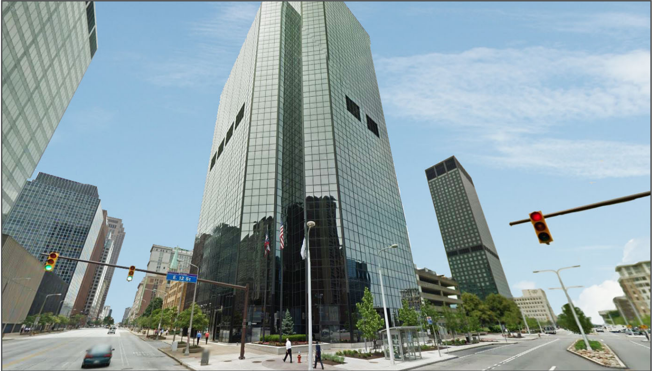
VIEW OF BUILDING